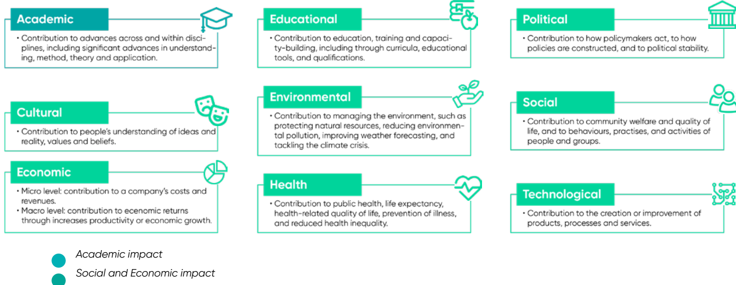
Figure 1: Types of Impact (adapted from stories.nuigalway.ie/research-impact-toolkit ) (European Commission 2010; Delanghe and Teirlinck 2010)